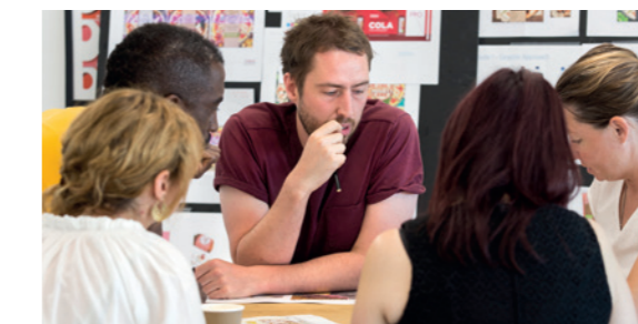
Ogilvy & Mather, a Living Wage employer

Living Wage South Bank incorporated multiple engagement opportunities, with feedback and contributions from a range of business sectors informing the research and the report. This encompassed: gauging awareness of the Living Wage accreditation process and potential barriers; project promotion; 121 meetings; and business seminars. Overall, more than 250 business were engaged in the project.