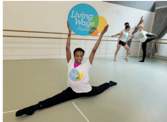
Rambert, a Living Wage employer

We look forward to working with employers, business groups, Business Improvement Districts and others in the continuation of this work.